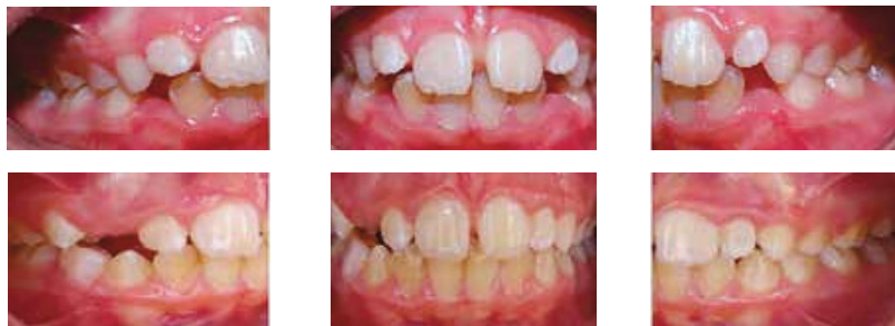
FIG. 10 Case 4 age 8, ternale, altered tongue posture, deepbite, atypical swallowing. Before (A, B, C), at 8 months (D, E, F).