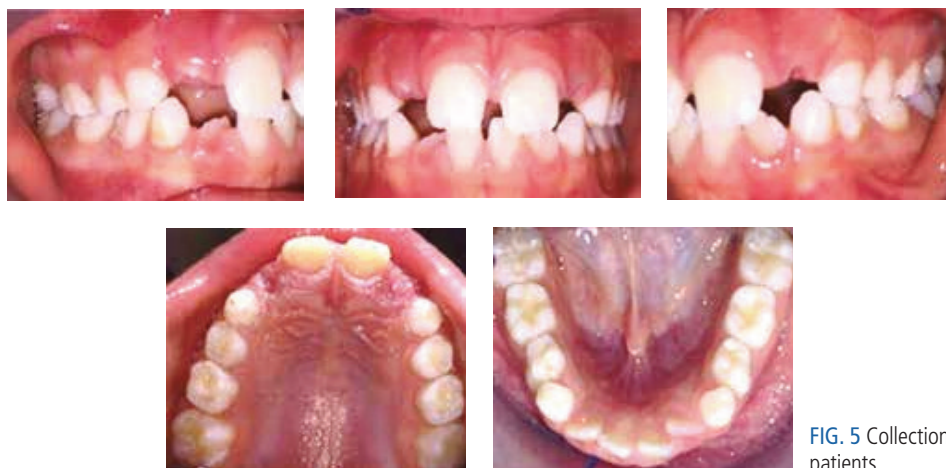
FIG. 5 Collection of intraoral photos of patients.