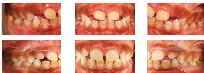
FIG. 8 Case 2 age 8, male, altered tongue posture, open bite, atypical swallowing. Before (A, B, C), at 6 months (D, E, F).