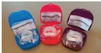
FIG. 1 Froggy Mouth is a small removable appliance.

The aim of this article is to describe the clinical protocol of Froggy Mouth, an innovative and simple myofunctional appliance used in order to solve atypical swallowing and to allow myofunctional correction of altered tongue position.