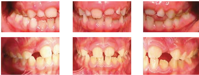
FIG. 9 Case 3 age 7, male, altered tongue posture, crossbite, atypical swallowing. Before (A, B, C), at 6 months (D, E, F).